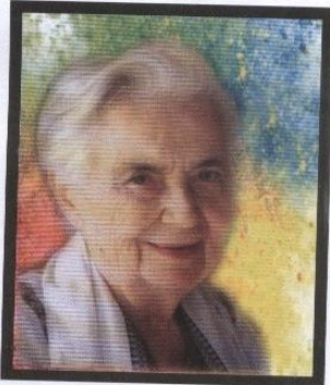
First Day Of Issue

DR. RUTH KATHARINA MARTHA PFAU (1929 - 2017)