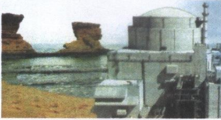
First Day Of Issue